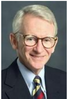
Joe Riley, Jr.

Order of the Palmetto and South Carolinian of the Year; the Verner Award by the South Carolina Arts Commission (1982); Municipal Leader of the Year by American City & County (1991); Thomas Jefferson Award from the American Institute of Architects for Public Architecture (1994); Seaside Prize from the Seaside Institute (1997); President's Award from the U.S. Conference of Mayors, for outstanding leadership (2000); Urban Land Institute J.C. Nichols Prize for Visionary Urban Development (2000); Keystone Award, by the American Architectural Foundation (2002); one of the 25 most dynamic mayors in America by Newsweek Magazine (1996); The American Society of Landscape Architects named him an Honorary Member, for leadership and vision; enshrined in The Citadel Athletic Hall of Fame (2014); and was a recipient of The National Medal of Arts in 2009, as presented by President Barack Obama.